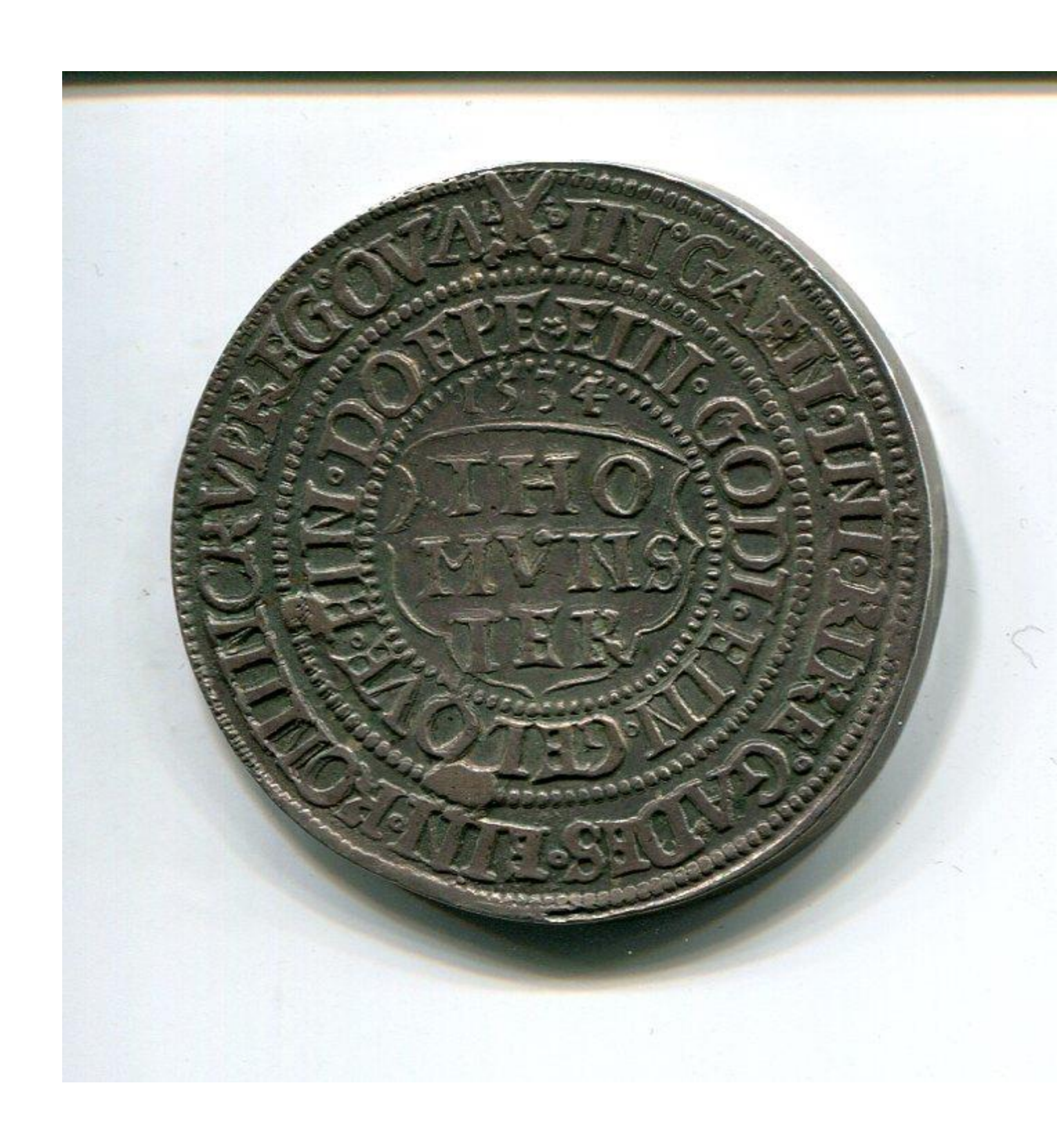
51.52~\rm g . It is slightly underweight for a 2 Taler and is sometimes called a 1~\rm 3/4 Taler. 47 mm diameter.